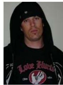
"ANONYMOUS" Christian Rap Artist