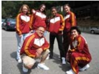
"NTENSE" Dance Team