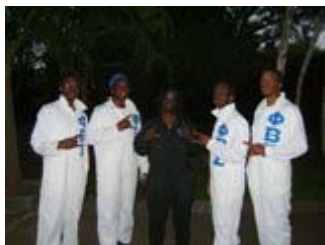
"PHI BETA SIGMA" Step Team