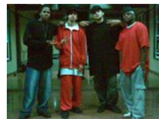
"TRUE STYLE" Acappello Singing Group