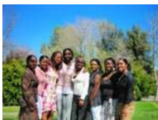
"UC DAVIS BLACK CAMPUS MINISTRIES" CHOIR