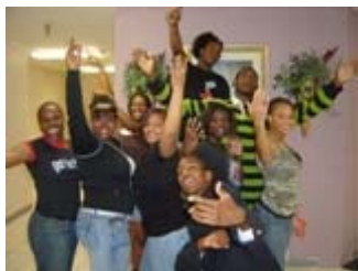
"RIVERS OF LIVING WATER" Drama Ministry